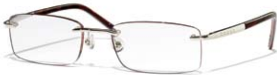
Byron. Rimless style with larger lens, polished silver-tone appointments and dark tortoise temples. RD0080-1 $30