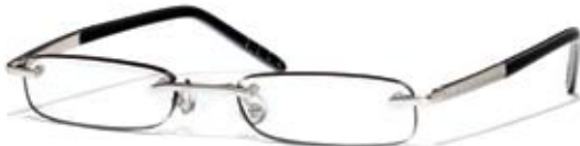
Melville. Rimless narrow lens style with matte silver-tone appointments and glossy black temples. RD0030-2 $30