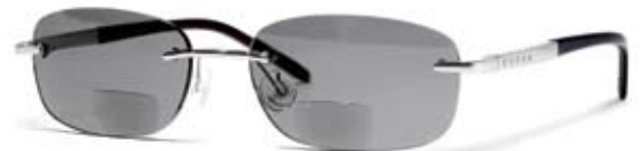
Clancy. Rimless deep lens sun reader with matte silver-tone appointments and matte dark grey temples. RD0061-1 $35