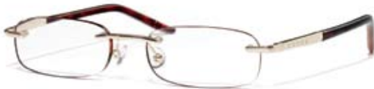
Joyce. Rimless, medium lens style with matte gold-tone appointments and amber tortoise temples. RD0020-2 $30