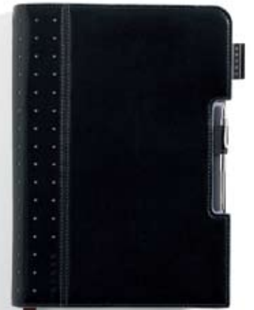
Cross Signature Journal Medium $25 AC210-1M Black & Grey