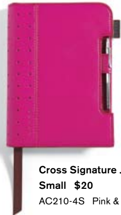
Cross Signature Journal Small $20 AC210-4S Pink & Red