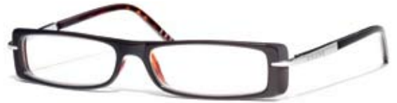
Walker. Modern and feminine, two-tone black and dark tortoise frame with medium lens, polished silver-tone appointments. RD0090-1 $30