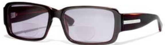
Shelley. A fashionable full frame deep lens sun reader featuring a black frame with subtle crystal pink undertone. RD0101-1 $35

Add a letter A, B, C, D, E, F, G, or H after each SKU to specify the power.